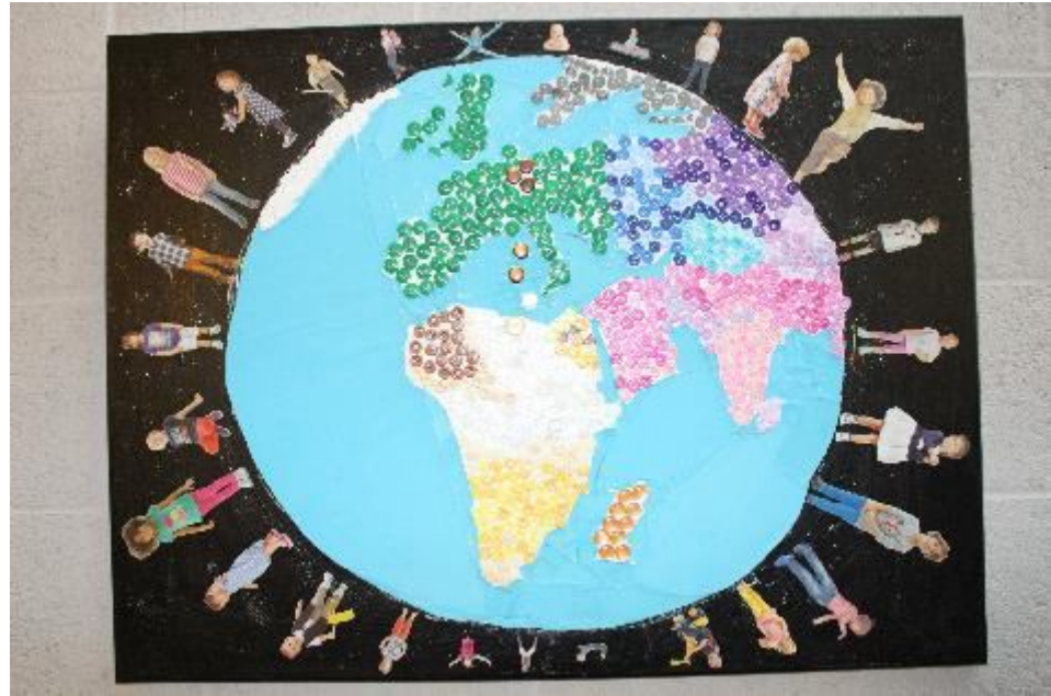
Caption: "We are holding the world together" by Kincsö und Aniko - canvas, buttons, paint, newspaper cut-outs, felt

At the beginning of March the immense volume of material collected during the campaign was handed over to more than 50 institutions for children and young people. Here the carers were able to stock up with the latest products available on the creative market. The range runs from canvases, to paintbrushes, paints, pens and fabrics, to modelling clay, stamps, stickers, and much more.