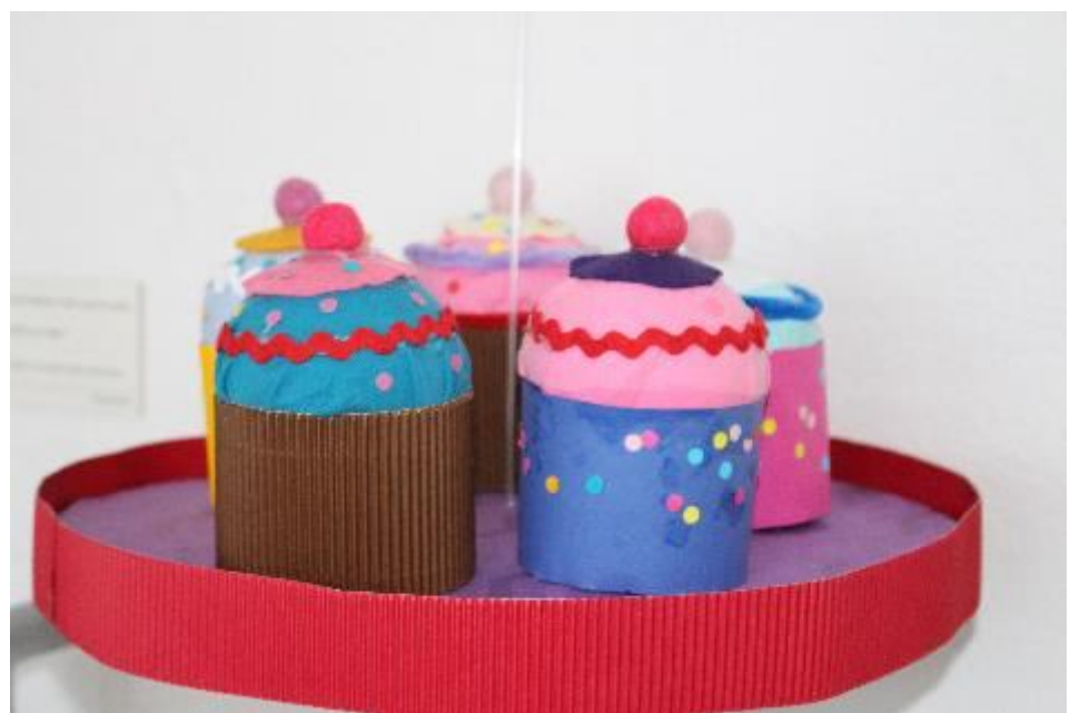
Caption: "Swett muffins on a tray", by Melina, Annika, Marlene, Lilian and Laura (ages 5) – styropor globes, coloured fabrics, paper, decorative materials, glue

At the beginning of March the immense volume of material collected during the campaign was handed over to more than 50 institutions for children and young people. Here the carers were able to stock up with the latest products available on the creative market. The range runs from canvases, to paintbrushes, paints, pens and fabrics, to modelling clay, stamps, stickers, and much more.